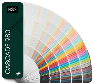
Arranged by Hue